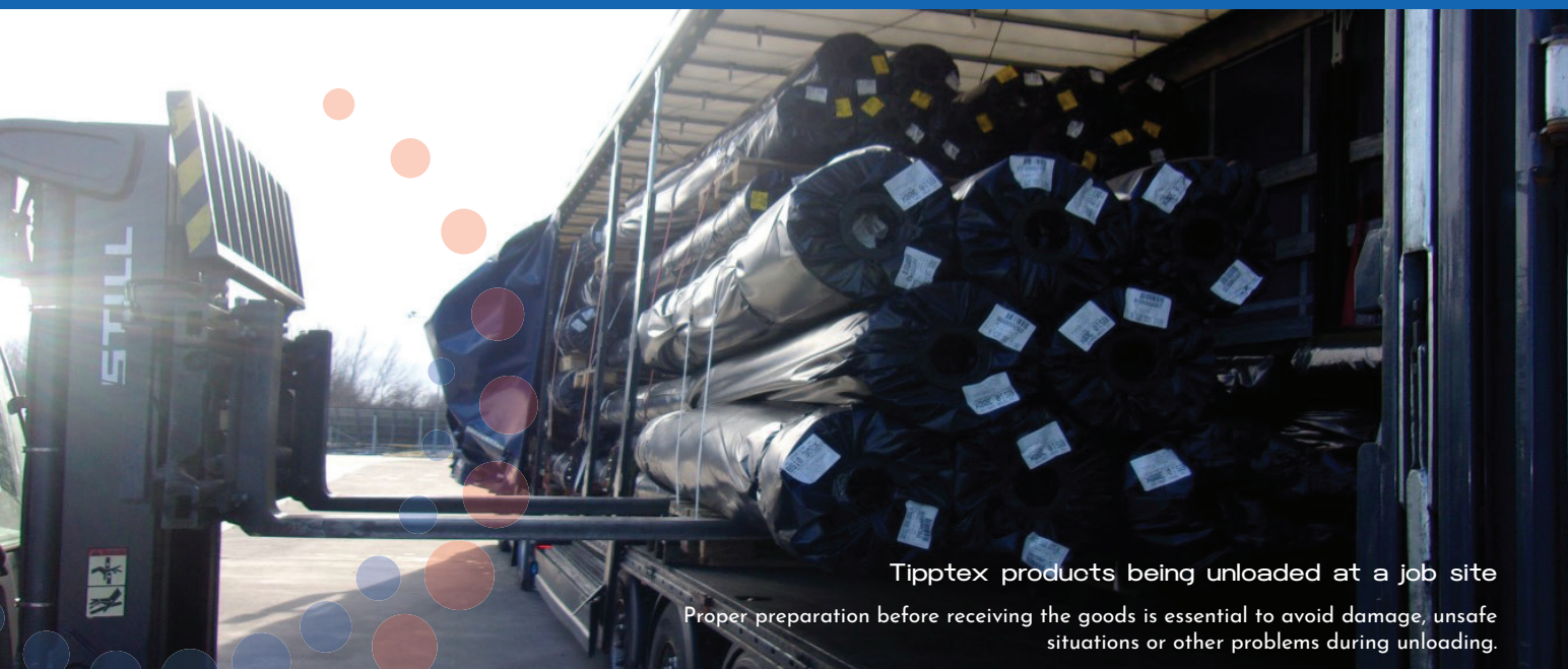
Tiptex products being unloaded at a job site

The following guidelines (*) facilitate the unloading of our products in a safe and efficient way. The goal of BontexGeo is to help create a safe environment for our customers and their (sub)contractors and assure the quality of our products until storage and/or installation.