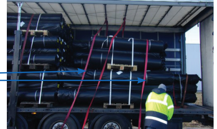
E.g. the outer straps first, followed by the straps of the separate loads.

The opening of the straps needs to start with last straps used by BontexGeo mostly securing the full load. The rest of the opening is to be continued in reverse order.